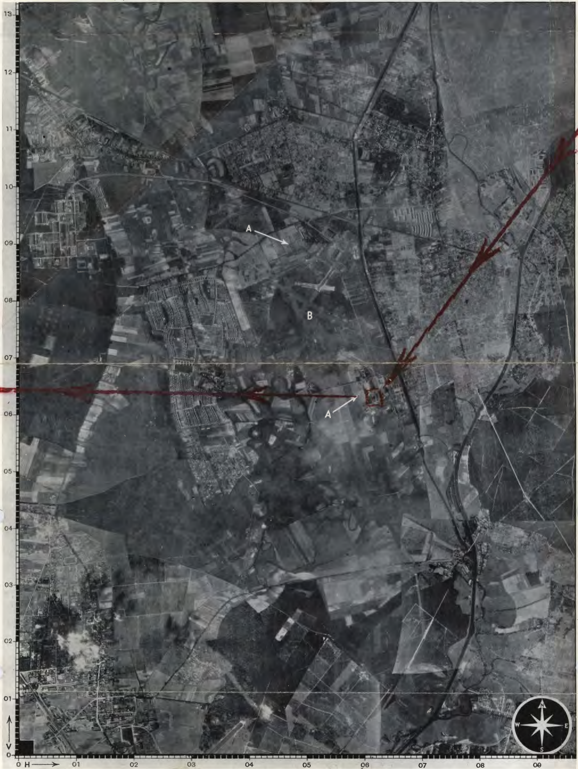
Illustration No. 3 (e) 40/5